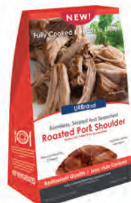
1 lb Carton

As a custom manufacturer, all Miniati's products are distributed with private-label branding. We are ready to add your brand to our current packaging options.