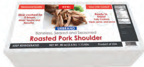
2.5 lb Box