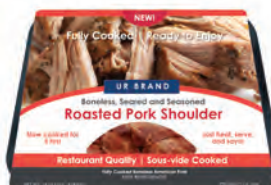
1 lb Tray Pack